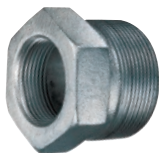
Female Spud with Copper Seal (Female NPT x Male NPS)