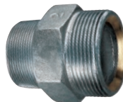
Male Spud with Copper Seal (Male NPT x Male NPS)