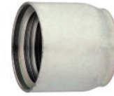
Crimp Ferrule for use with Female Ground Joint (SHGJ Series)*