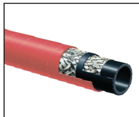
T343 Series EPDM Steam Hose with Oil Resistant Cover

Refer to pages 26 and 27 of the Alfacomma Catalog for details.