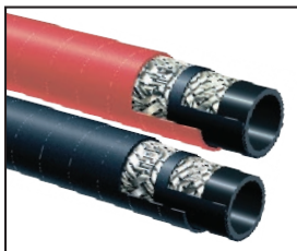
T341 Series Chlorobutyl Steam Hose