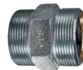
Double Spud with Copper Seal (Male NPS x Male NPS)