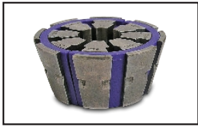
T400 12mm Die Set P/N:PF402-12D