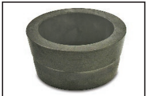
Adapter Bowl 420 to 400 Bowl P/N:PF420/400-AB