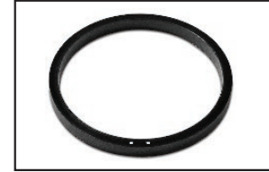
T400 Spacer Ring #2 P/N:PF402-2-SR