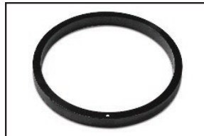
T400 Spacer Ring #1 P/N:PF402-1-SR