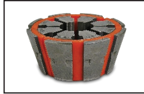
T400 17.4mm Die Set P/N:PF402-17.4D