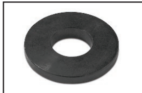
T400 Main Pusher Plate W/ Magnets P/N:PF400-MPP