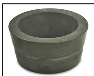
Adapter Bowl 420 to 400 Bowl P/N:PF420/400-AB