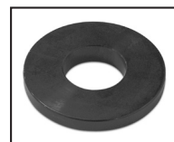
T400 Main Pusher Plate W/ Magnets P/N:PF400-MPP