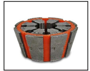
T400 17.4mm Die Set P/N:PF402-17.4D