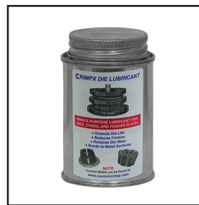
CRIMPX Die Lubricant (Available) Grease 4 oz can with brush P/N:104162