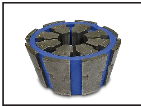
T400 22.2mm Die Set P/N:PF402-22.2D