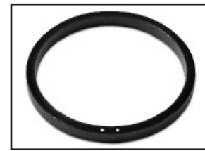
T400 Spacer Ring #2 P/N:PF402-2-SR