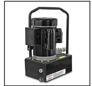
Electric Pump (Available) P/N:VEP1001