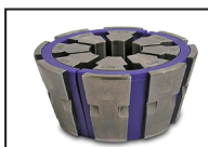
T400 12mm Die Set P/N:PF402-12D

Light Weight Portable Unit: Truly "portable" crimper can be carried to almost any location where service is required.