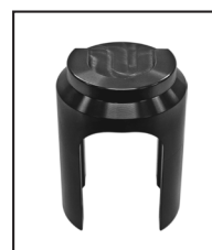
Removable Pusher P/N:100825