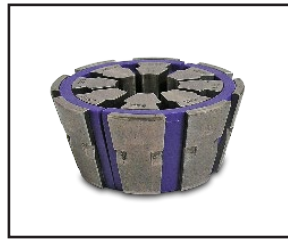
T400 12mm Die Set P/N:PF402-12D