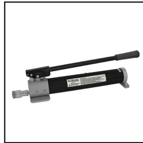
Hand Pump (Available) P/N:VHP-10-43