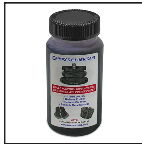
CRIMPX Die Lubricant: Oil 4 oz bottle with dauber cap (Included) P/N:103886