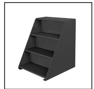
Die Storage Shelf (Available) P/N:101431