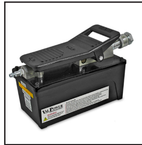
Pneumatic Pump (Available) P/N:VAP-10-100