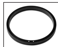
T400 Spacer Ring #2 P/N:PF402-2-SR