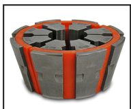
T400 17.4mm Die Set P/N:PF402-17.4D