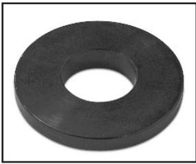
T400 Main Pusher Plate W/ Magnets P/N:PF400-MPP

The PF402 Tooling is compatible with most of the weatherhead® crimpers.