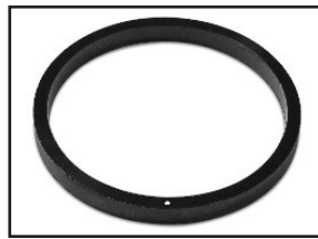
T400 Spacer Ring #1 P/N:PF402-1-SR