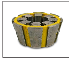
T400 14.2mm Die Set P/N:PF402-14.2D