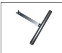
Die Change Tool