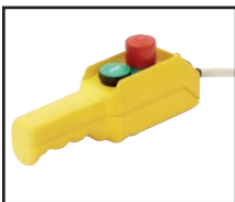
Handheld Electronic Control