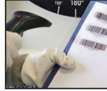
ES4 Upgrades (pgs. 36 & 37)