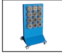
Die Cart (24 pc.) DIECART-V119