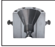
Custom Made Dies (pg. 41)