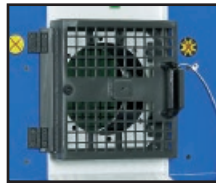
Protection Net with Activation Switch