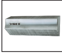
Marking Dies (pg.41)

* Works with both KC3-V150 & KC3-V159 Series Crimpers