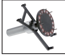
Patented Quick Change Die Tool KCPQCT-V159*