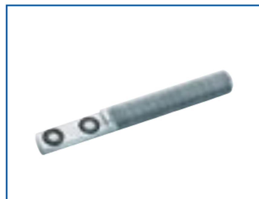
Die Change Tool KCDCT-H39