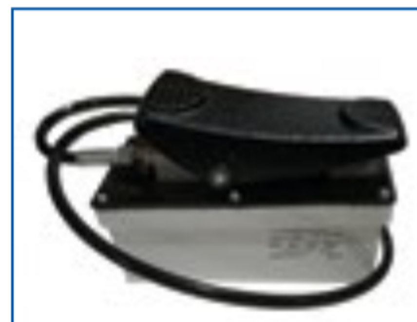
Air Pump KC1-H47E-PAP