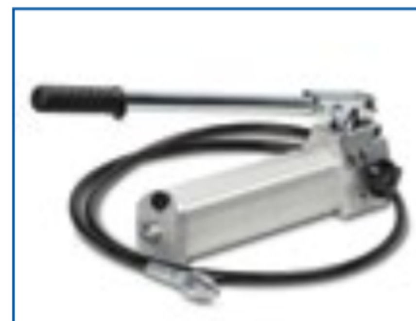
Hand Pump KC1-H47E-HP