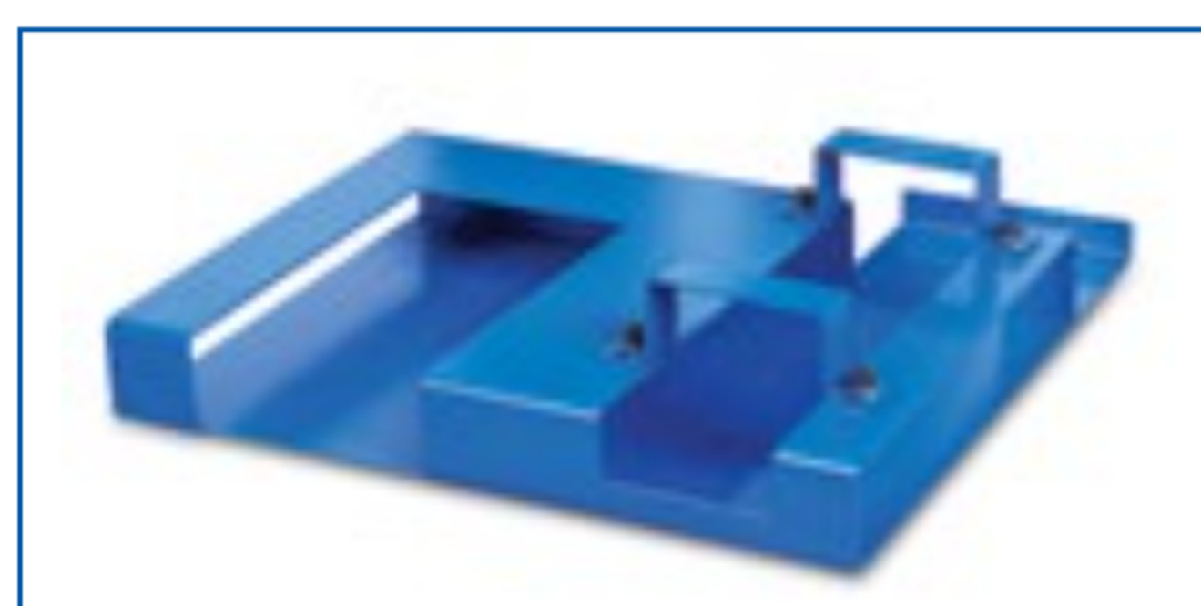
Support Frame KC1-H47E-BASE