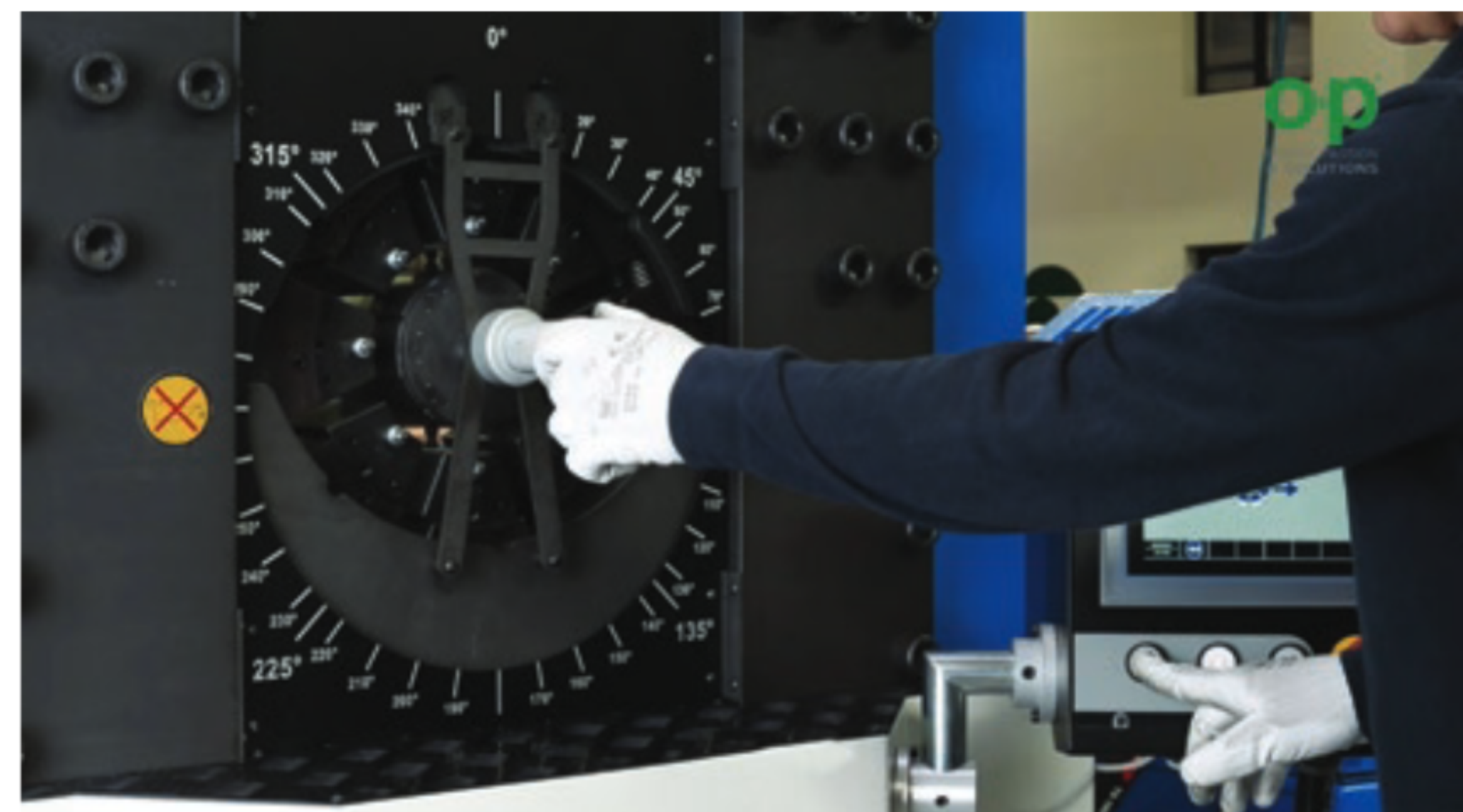
Tool held in place by built-in locking posts inserted into the crimper on smaller and larger sized crimpers.