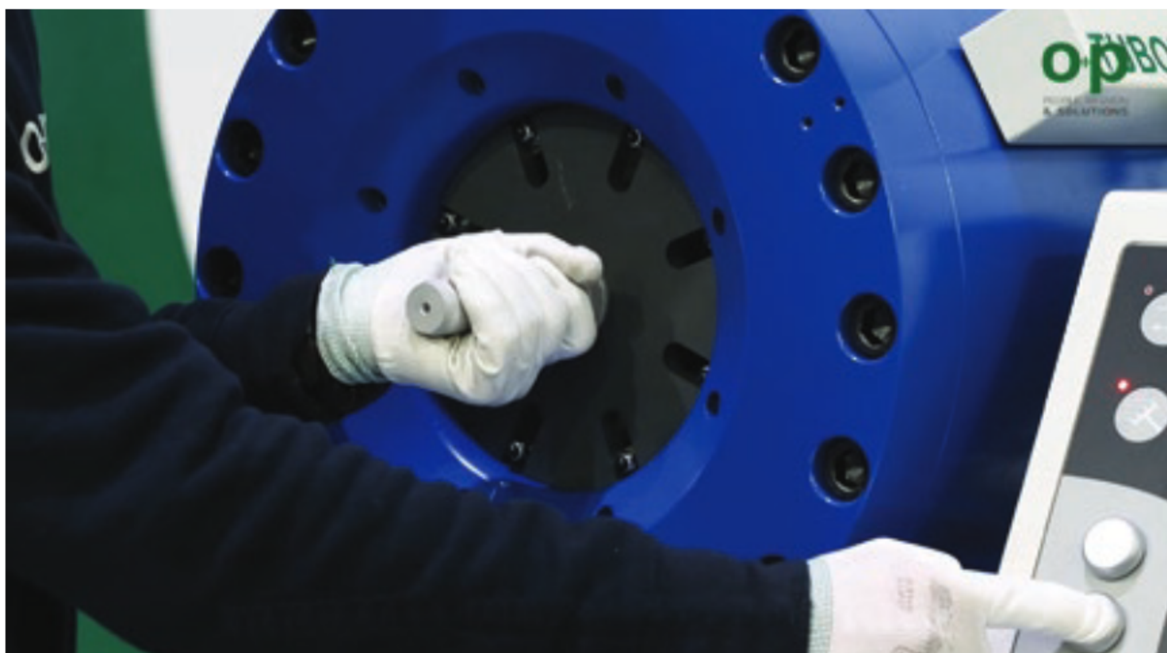
Master dies are guided through built-in channels on the tool on mid-sized crimpers.

The innovative, Easy Set™ Patented Quick Change Tool provides a quicker, easier and safer way to change out crimp dies. Traditional quick change tools must be manually centered and carefully held in place during the die changing process. Even a slight misalignment could cause the dies to be slightly out of place, potentially causing costly damage to the dies or the machine itself. However, the Easy Set™ Quick Change Tool's patented centering guides hold the tool in the correct position throughout the die changing process with minimal user effort, eliminating the risk of user error.