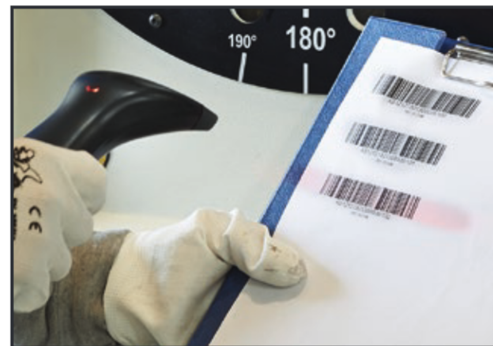
Barcode Reader instantly calls up saved crimp diameter