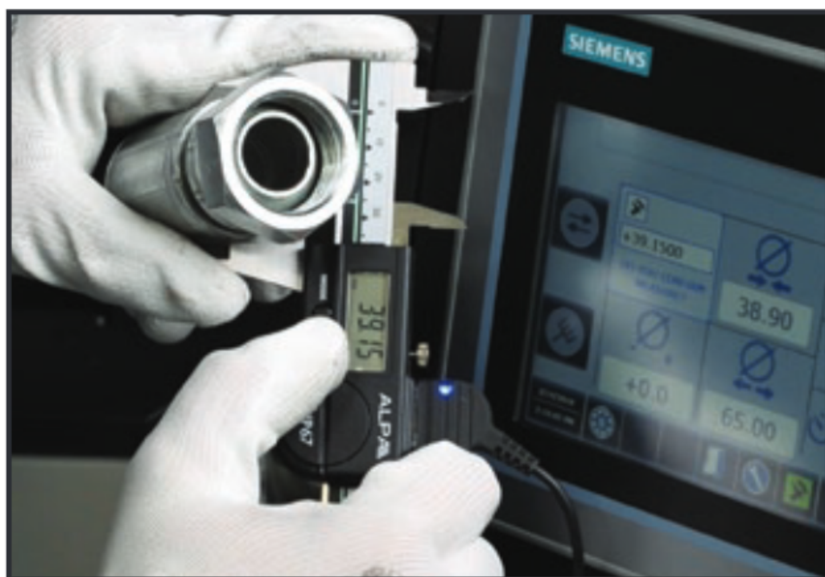
Digital Caliper automatically generates crimp correction for safety.

Webcam – Camera allows operator to view crimping process through 8" monitor. Includes additional LED lighting for better visibility.