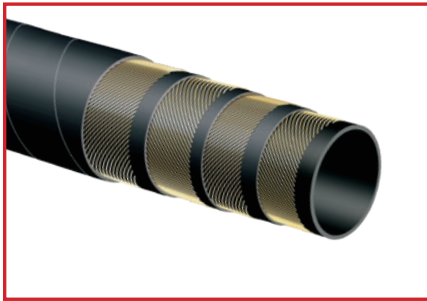
T740AA Wire Reinforced Concrete Hose

Both hoses have abrasion resistant natural rubber (NR) tubes to handle the abrasive sand and gravel contained in cement mixtures. As a result, the T74SAA can also be successfully used in boom concrete pump applications where a lighter weight hose is preferred.