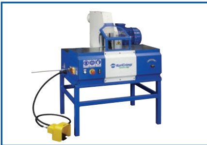
KCS-TF5-230/3 Hose Cutter

The line also includes a complete assembly system, brought to you by our line of KuriCrimp™ Crimpers and Hose Processing Equipment. The heavy duty nature of concrete hose provides additional challenges in the hose assembly process. In particular, concrete hose provides additional challenges with fitting insertion due to the interference fit between the hose and fitting shank. The KuriCrimp system includes our KPUSH22-CON 22,000 lb. Heavy Duty Hose Pusher, custom modified with fitting insertion mandrels and hose clamp attachments, specifically designed for Conqueror Concrete Hose and Couplings.