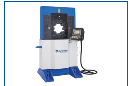
KC4-V160-230/3 High Volume Crimper

Because we continually examine ways to improve our products, we reserve the right to alter specifications or discontinue products without prior notice.