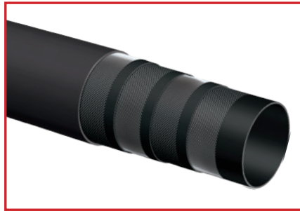
T74SAA Textile Reinforced Concrete Hose