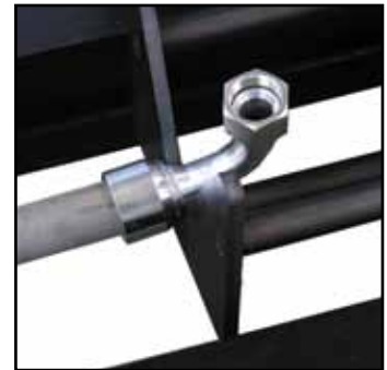
The elbow fitting adapter adds to the versatility of the KFP-10.

With the KFP-10 Fitting Pusher's low profile, swivel Casters and 110 Volt requirement it can be quickly and easily moved to the job. The simple strap hold down system makes it easy to quickly and accurately position the hose.