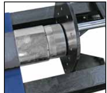
This fitting took 7 seconds to install.

“Traditional” methods of installing large fittings can result in damaged fittings, and at the very least is a time consuming procedure.