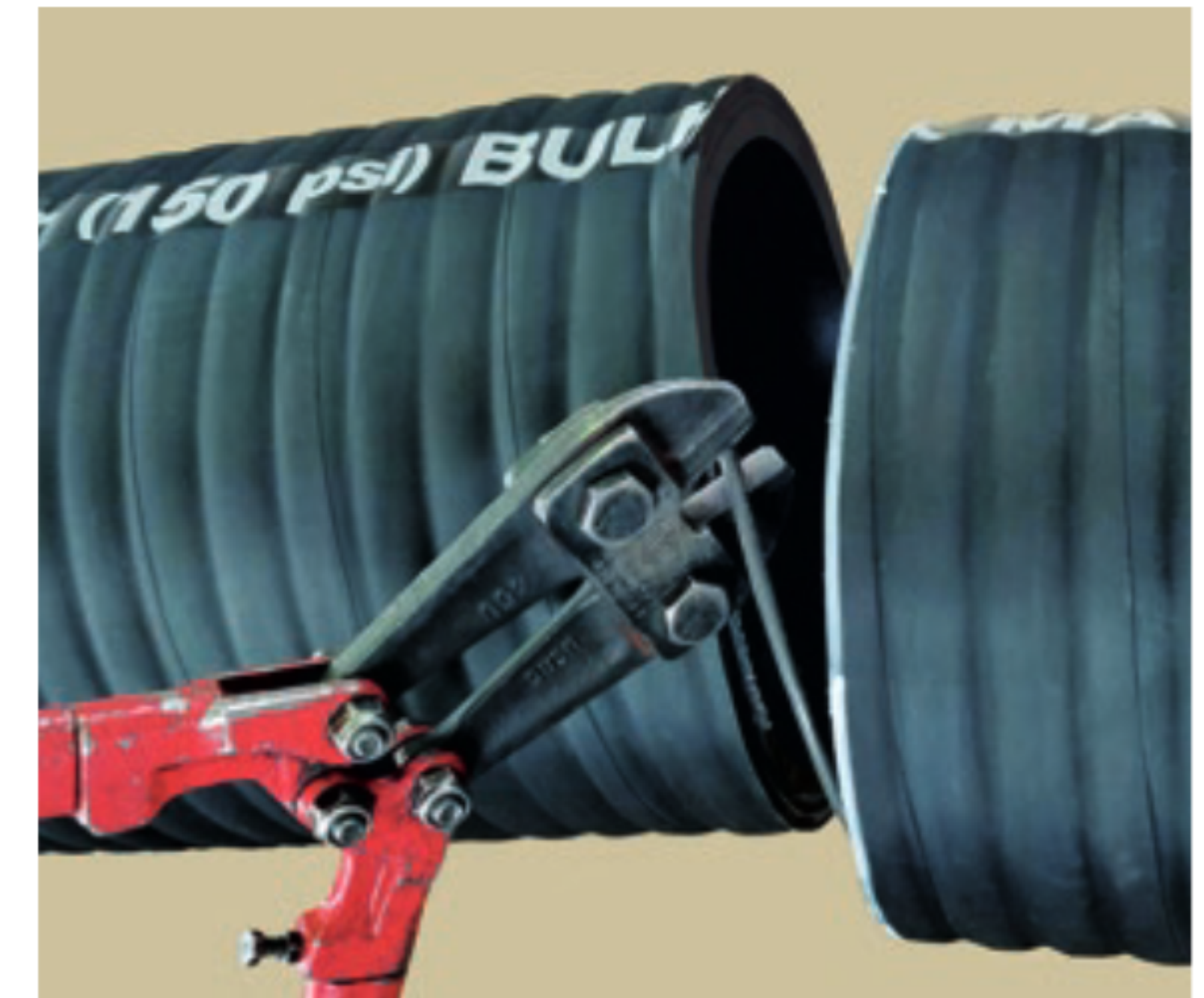
3 Cut the steel helix wire. The wire must not protrude past the end of the hose