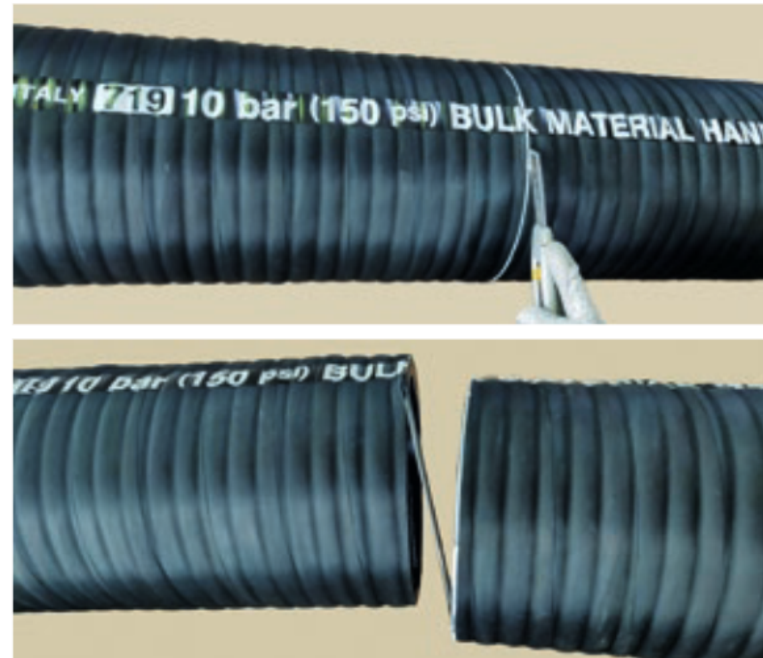
2 Cut the hose with a sharp cutting tool up to the steel helix wire