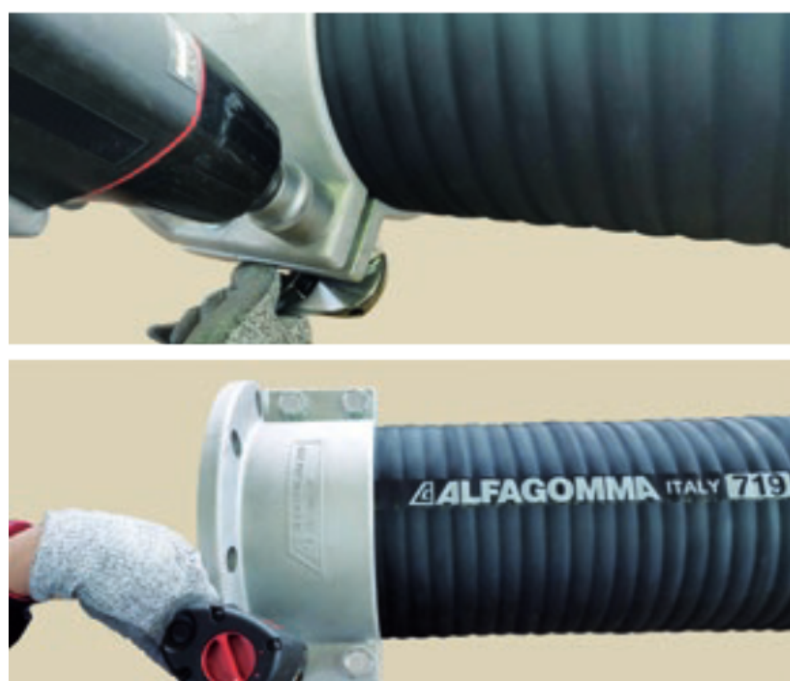
4 Place the two half shells onto the hose and tighten the side flange bolts. The corrugation inside the muff coupling must align exactly with the corrugation of the hose cover