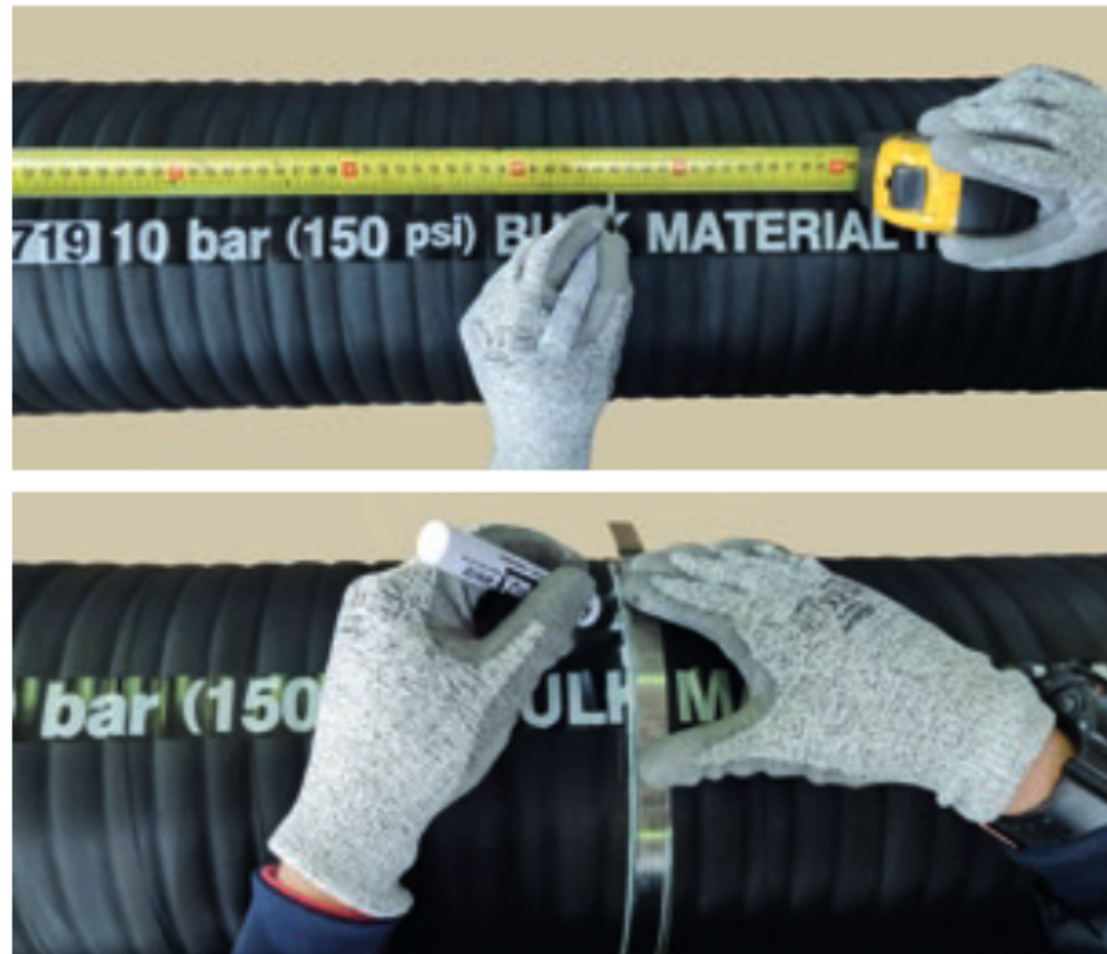
1 Measure and mark the hose to the required length