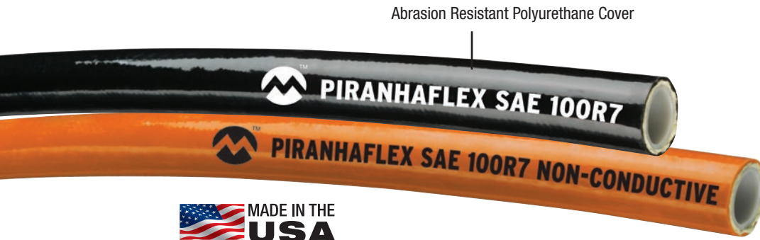
Abrasion Resistant Polyurethane Cover